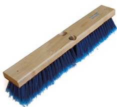
Blue Boy 18