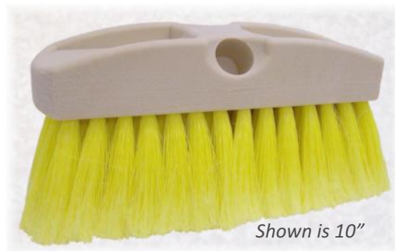
Shown is 10"

With it's thick, fluffy fibres, this is the best "All Purpose Brush"