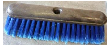
12" Upright Broom