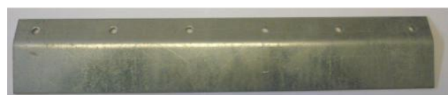
14 Gauge galvanized scraper

High quality fiberglass pole features easy twist - lock operation. Durable fiberglass outer pole with sliding inner pole that easily adjusts and locks into place. Pole comes in two sizes, 4-8' or 6-12'. Both have durable metal tip.