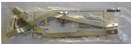
6699 - Aluminum regular broom brace