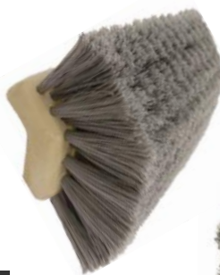
Bi-Level Brushes are best for broad surfaces where maximum contact is required