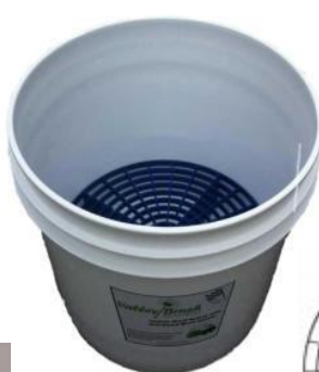
Wash Bucket with grit guard system