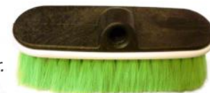
The 214NP-9" with bumper.