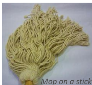
Mop on a stick