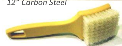
White Sidewall brush