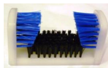
Floor Mounted Boot Brush