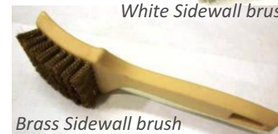
Brass Sidewall brush