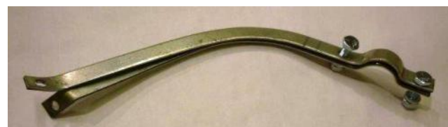
12 Gauge galvanized H/D broom brace