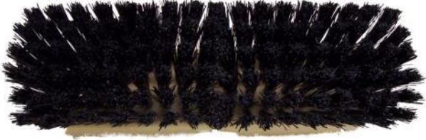
8" & 10" heads