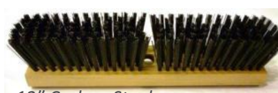
12" Carbon Steel