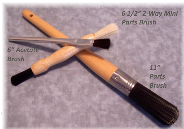
6 1/2" 2-Way Mini Parts Brush