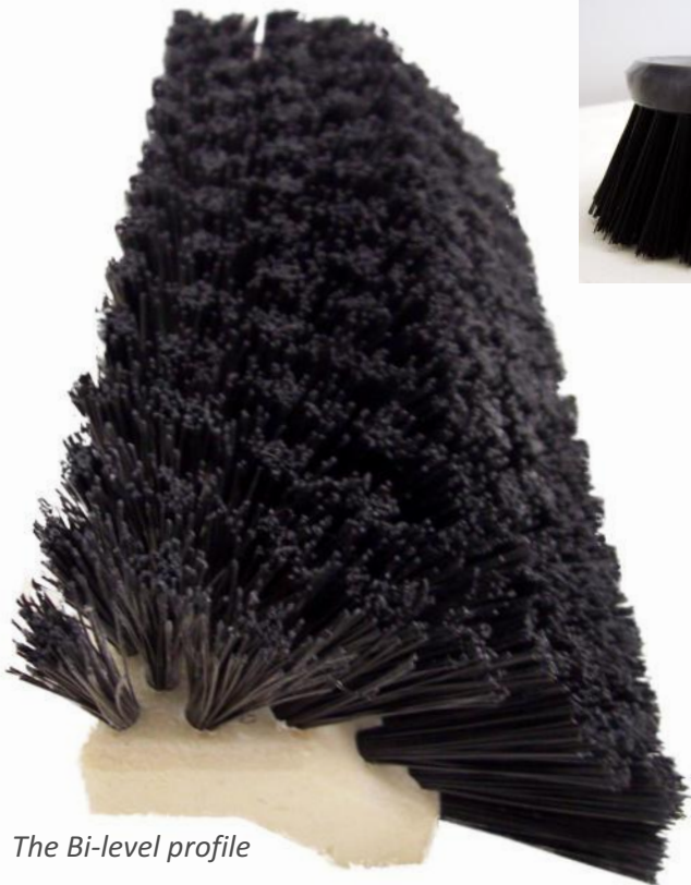
The Bi-level profile