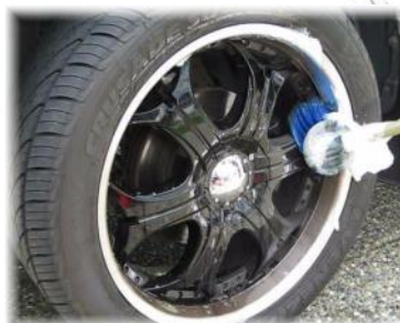
The 315 LT Round Brush is handy for wheels and tight spaces.

The 118 stiff bi-level is great for removing baked on guano from hi-rise windows.