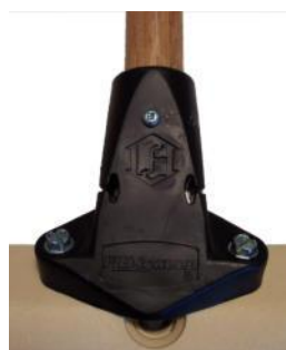
Unbreakable Connector Front (attached to head)