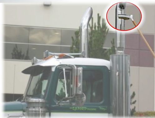
Stack Brush in use