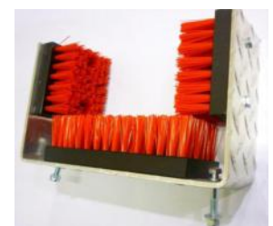
Checker Plate Boot Scrub