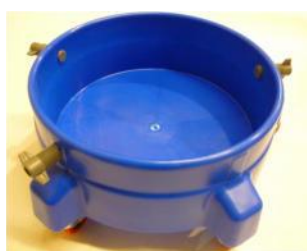
Grit Guard 5 Caster Dolly