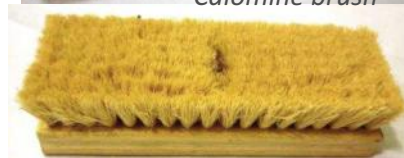
Mason Acid brush