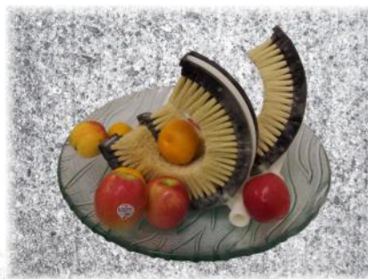
Stack Brushes are available in 2 sizes, S and L