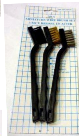
3 pc SM scratch