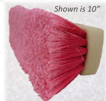
Shown is 10"

The ends are flagged to increase fluid retention and cleaning power.