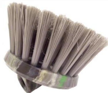
The Round Brush is perfect for getting into tight spaces such as siding and wheels