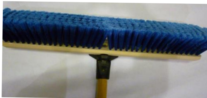
New soft Body Shop sweep head