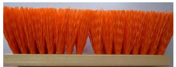
18" Barn Broom