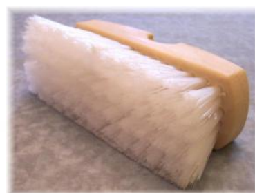
Shown is the 222N-8"

Durable nylon fibre, popular in households and for less aggressive industrial applications. Excellent wet stiffness and flex fatigue. Inert to most strong acids and bases.