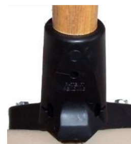
Unbreakable Connector Back (attached to head)