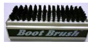
Truck Mounted Boot Brush